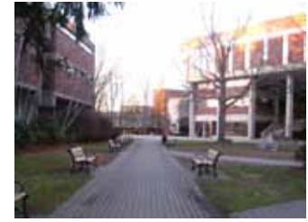
STUDY BUILDING EXTERIORS