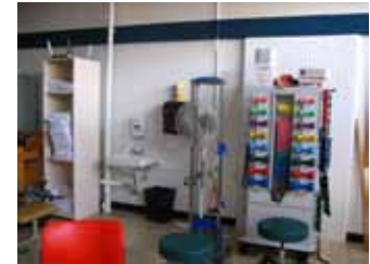
STUDY BUILDING INTERIORS